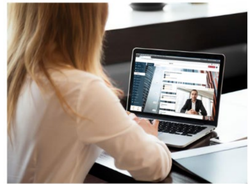
Attendees can participate and interact from anywhere on any device.